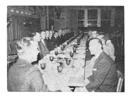
SPOKESMEN GATHER FOR DINNER

those who are really a part of its functions. We know that through it we shall be properly equipped to give an answer for the hope and the faith which are within us.